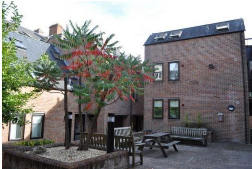
Bear Lane courtyard

Bear Lane is in a central location just below the High Street and is thus close to college as well as the Westgate Shopping centre, Covered Market, and Examination Schools.