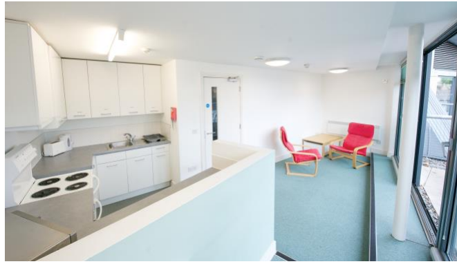
Communal living space