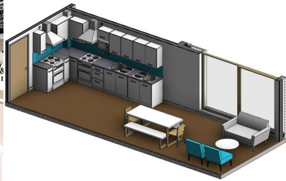
Sample kitchen layout