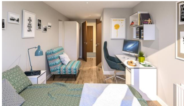
Mock up room

Flats (referred to as Clusters) are either 5 or 7 residences, but the rooms in flats of 5 may be larger and are thus A grade. Rooms of B and C grade are on lower floors and receive slightly more noise from the street, though rooms facing Queen Street receive more noise generally. The floorplans between rooms are fairly uniform and therefore noise and amount of natural light are the primary differences between rooms of different grades, all rooms themselves are the same quality. Residents share a kitchen with their flatmates, and each kitchen has 2 full ovens, and 2 fridges. Carfax is ideal for students who would like to live in the city centre and close to college, and prefer having a newer residence building with various amenities. Please find a sample floorplan and mock up image of a room below.